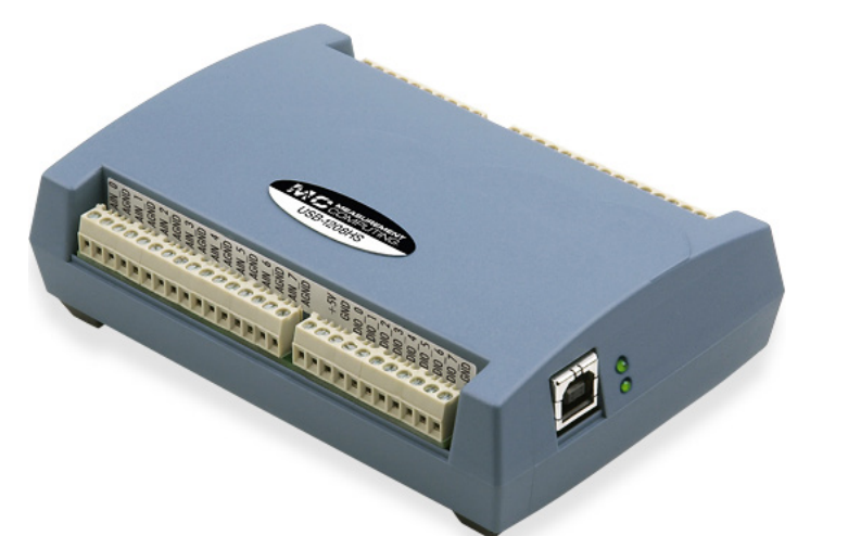
All USB-1208HS Series devices provide eight singled-ended or four differential analog inputs at up to a 1 MS/s sampling rate, and 16 digital I/O.